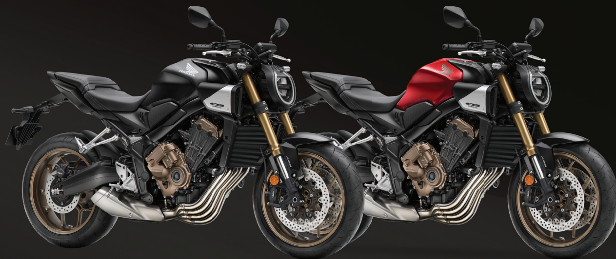
MATTE GUNPOWDER BLACK METALLIC